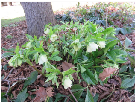
A Lenten Rose

Spring is around the corner. Though there still may be a few cold days to endure and even a little snow, we know before too long buds will be popping and new life in nature will be