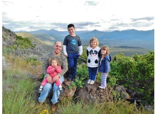
Our family enjoying the Pacific Crest Scenic Trail in northern California in 2015

While we are focusing on forgiveness at DMC right now, could you forgive me for saying to you, “Take a hike !!” ...?